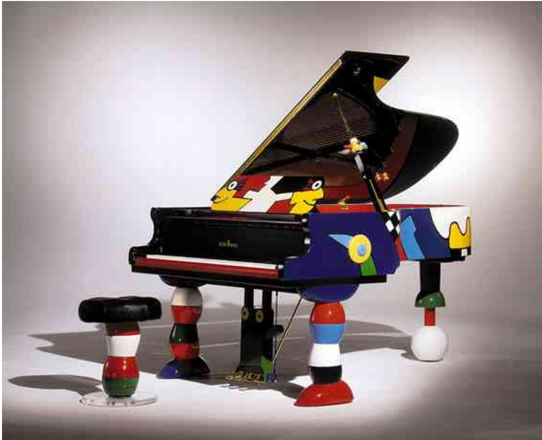
Schimmel Art Edition