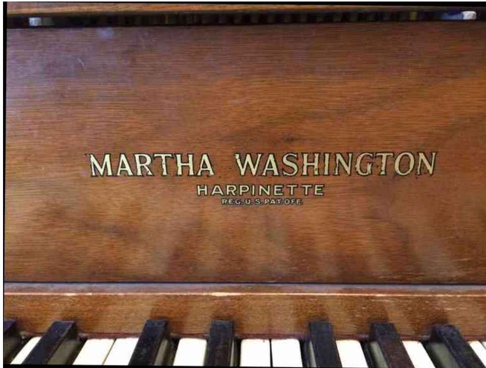
Martha Washington Console Harpinette Serial No. 170371, Year 1947 (from Jesse French numbers listed in the Pierce Piano Atlas, 12 th Edition)